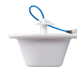
Blackhawk Ceiling Dome Antenna 698-4000 MHz 2/5dBi