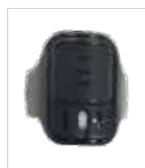
Wireless Finger PTT