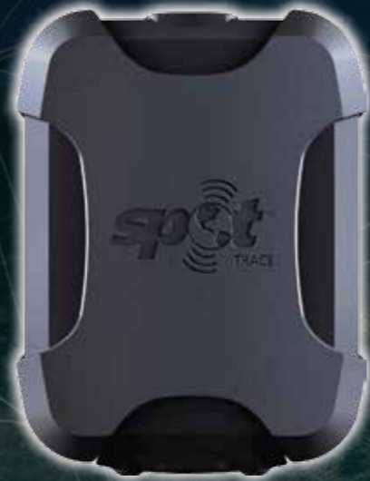
Pictured at Actual Size. 6.8cm x 5.1cm