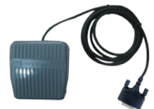
Foot Switch (External PTT) POA44