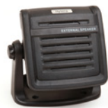
External Speaker Microphone SM09D1