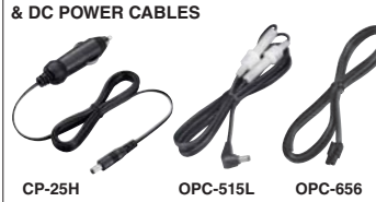
CP-25H OPC-515L OPC-656 For use with For use with For use with BC-210 BC-210 BC-197