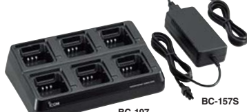
BC-197 BC-157S Charges up to six BP-245N in 2.5 hours (approx.). AD-129 is supplied with the BC-197, depending on version.