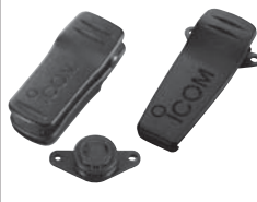
MB-86 MB-103 Swivel type Alligator type