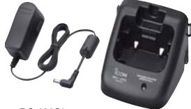
BC-123S* BC-210 Charges the BP-245N in 2.5 hours (approx.). * BC-123SA for 120V AC. SE for 230V AC.